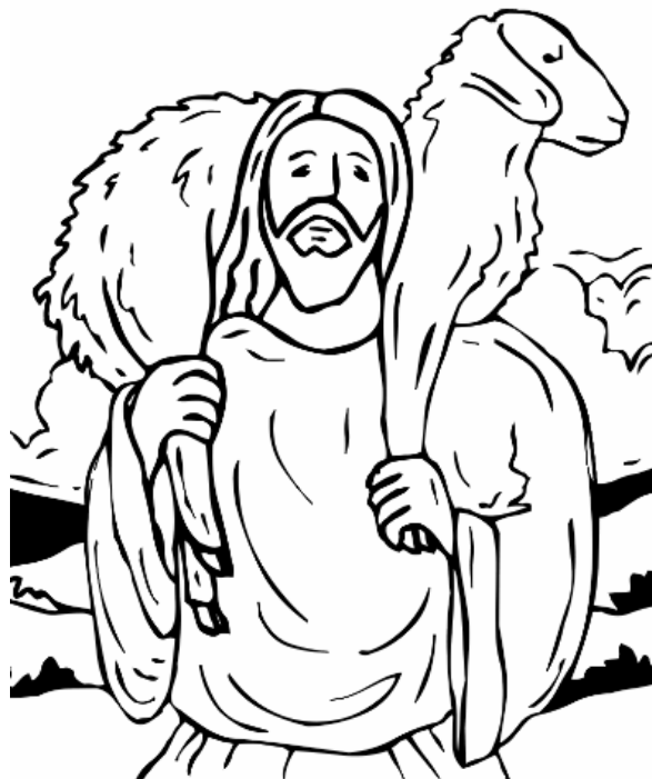
Jesus the Lamb of God