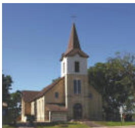
HOLY CROSS 10651 Co Hwy 8 Kimball, MN 55353 (320) 251-6944