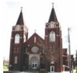
ST. NICHOLAS 15862 Co Rd 165 Watkins, MN 55389 (320) 764-7345