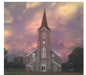
ST. WENDELIN 22714 Hwy 15 St Cloud, MN 56301 (320) 251-6944