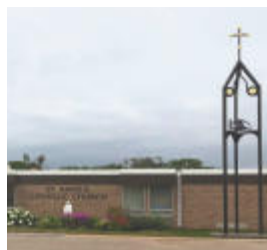
ST. ANNE'S 441 Hazel Ave E Kimball, MN 55353 (320) 398-2211