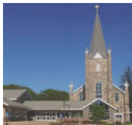
ST. MARY HELP OF CHRISTIANS 24588 Co Rd 7 St Augusta, MN 56301 (320) 251-1799