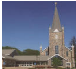
ST. MARY HELP OF CHRISTIANS 24588 Co Rd 7 St Augusta, MN 56301