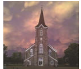
ST. WENDELIN 22714 Hwy 15 St Cloud, MN 56301 (320) 251-6944