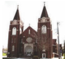
ST. NICHOLAS 15862 Co Rd 165 Watkins, MN 55389 (320) 764-7345