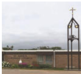
ST. ANNE'S 441 Hazel Ave E Kimball, MN 55353 (320) 398-2211