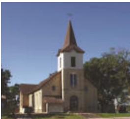
HOLY CROSS 10651 Co Hwy 8 Kimball, MN 55353 (320) 251-6944